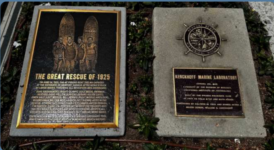
Bottom Left: Duke Kahanamoku